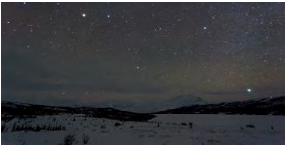
Night sky at Denali National Park.

Astronomy traditions vary across cultures, communities, and individuals. The information collected here is a small sample of how some cultures view the night sky.