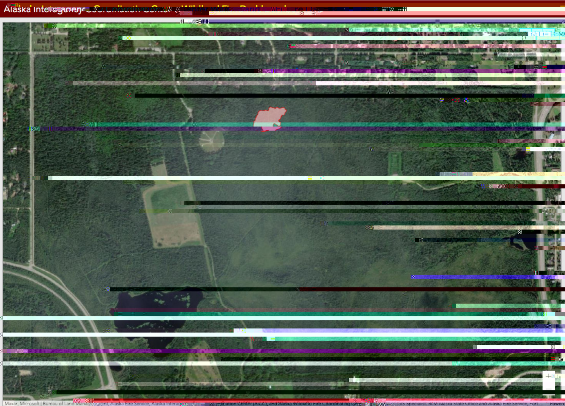
Yankovich Road - September 2021.